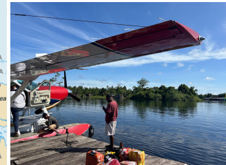
On the Jetty with the float plane in Papua &